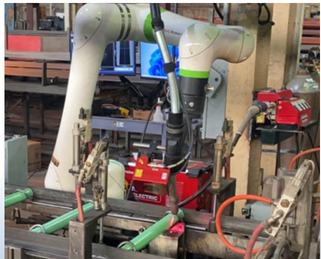
COBOT-Arc Welding Robot

Applying best practices in concrete construction improves concrete's resilience to remain intact and unaffected after water inundation.