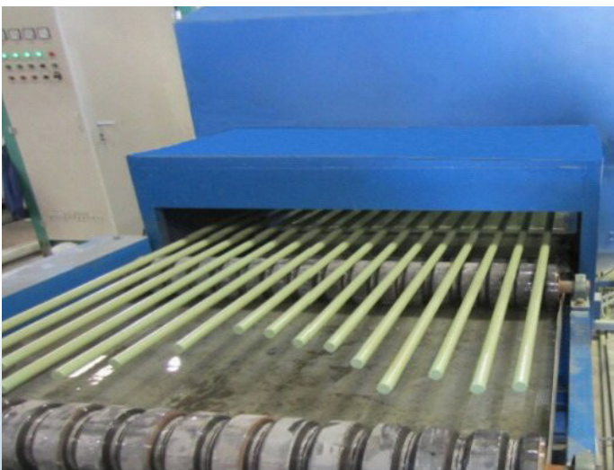
CRSI Approved Fusion Bonded Epoxy Bar Line

Our dowel bars and baskets are some of the best on the market. Every bar is cut to length with CNC saws, removing the possibility of burs that can occur when sheared. Our baskets are robotically assembled and welded for superior quality.